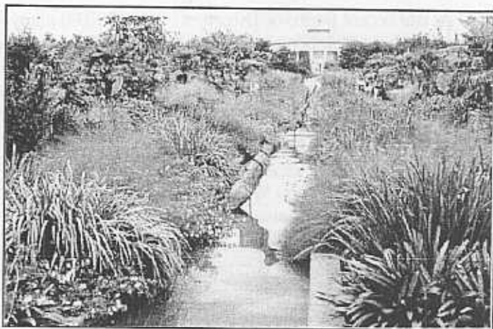
The Canal Garden

Coming up on their calendar is the opportunity to stroll though the Gardens as it is lit with more than 2,000 luminaries during the Annual Tree Lighting Event. Friday, December 5 at 7:00 promises to be a great night of music and festivities. (Admission is $5 for non-